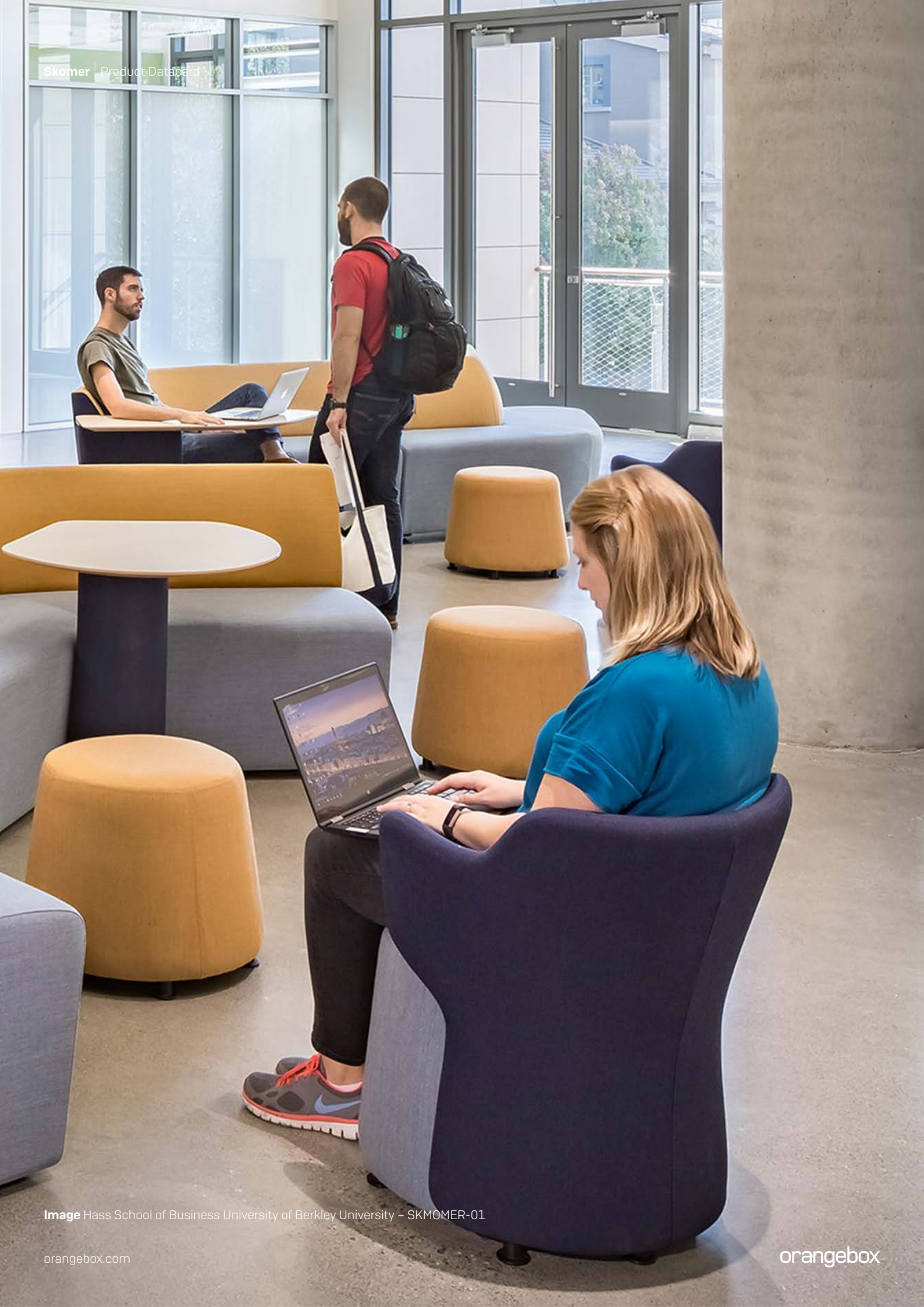
Image Hass School of Business University of Berkley University - SKMOMER-01