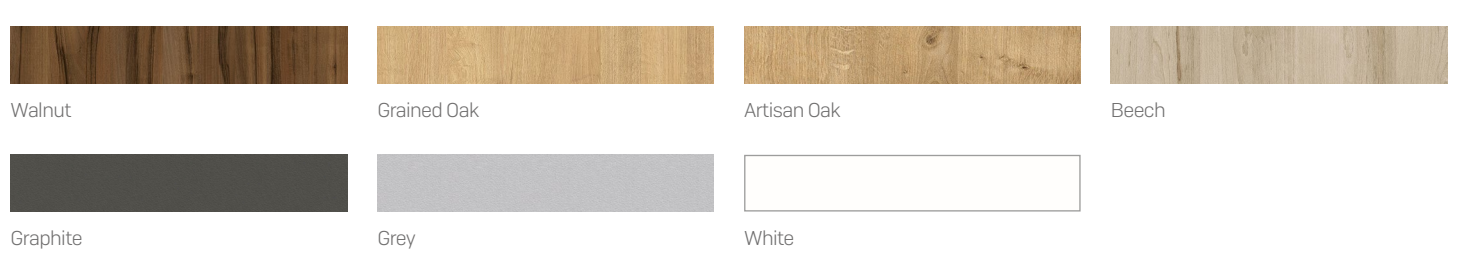
Table Tops — Melamine